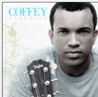
Released on September 28th, Coffey Anderson's new self-titled album features songs that mix pop, country, Christian and soul.

Posted by Candace on Oct 01, 2010 | 2 Comments