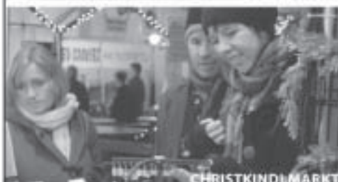
CHRISTKIND MARKET BANANA FACTORY